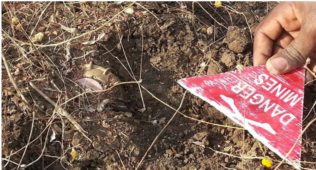
Landmine found in eastern Sudan.

As of July 2015, out of the 125 square km of contaminated land, 95 square km have been cleared, leaving 30 square km.