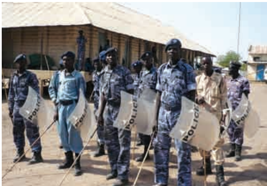
Election security anti-riot police officers, Malakal.

A n angry mob of 15 men storm a polling station as the emerging trends in the voting go against their candidate.