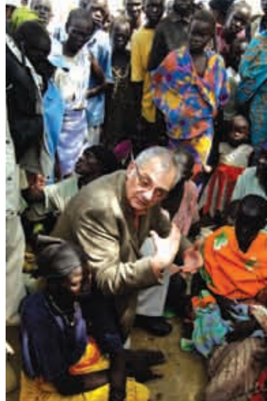
SRSG speaking to residents of Abyei displaced by fighting.

All problems have solutions at the technical level, but sometimes political will is lacking to provide an enabling environment. This is a function of the residual lack of trust (between the parties) that the leadership must overcome to preserve peace, no