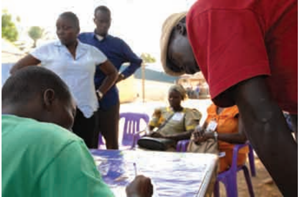
Voter registration for the planned April 2010 national elections underway in Juba.

The report acknowledges that important peace agreements were reached, including one between the Abu Junok (Nuba) and Um Sileem (Misseriya) on 5 October, ending a three-year conflict. But it lists several security incidents, mainly in Upper Nile, Unity and Jonglei states, which