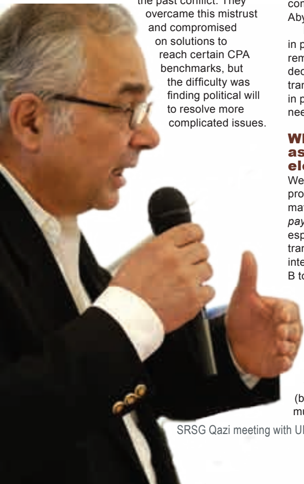
SRSG Qazi meeting with UNMIS staff in Juba.

The parties have identified 10 issues they must agree and make important progress