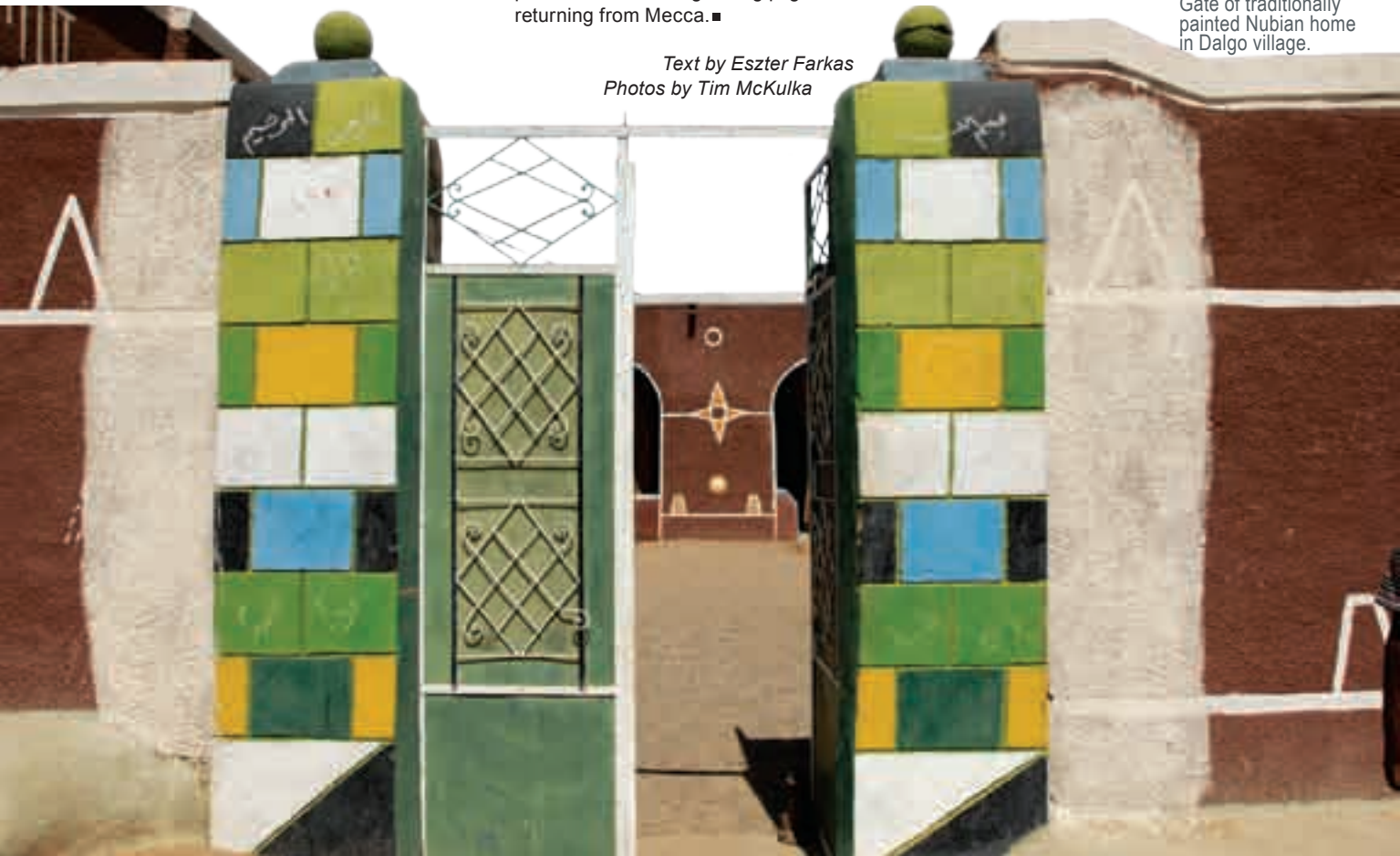
Gate of traditionally painted Nubian home in Dalgo village.