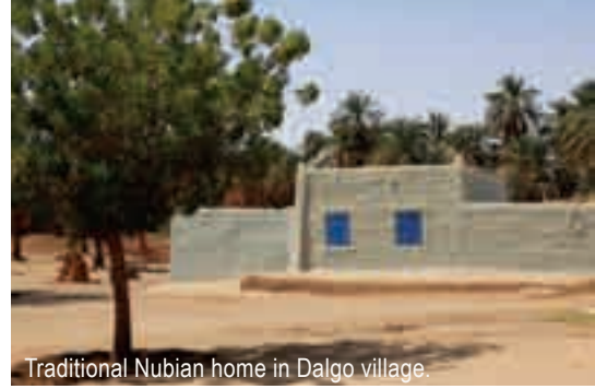
Traditional Nubian home in Dalgo village.