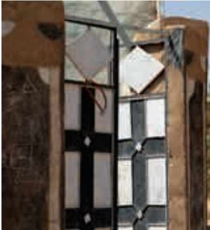
Gate of Nubian house in Dalgo village

N ubian civilization is one of the world's oldest, with artefacts as ancient as 7,000 years old. Nubian villages line both banks of the Nile from the first to the sixth cataracts, expanding from present-day southern Egypt to northern Sudan.