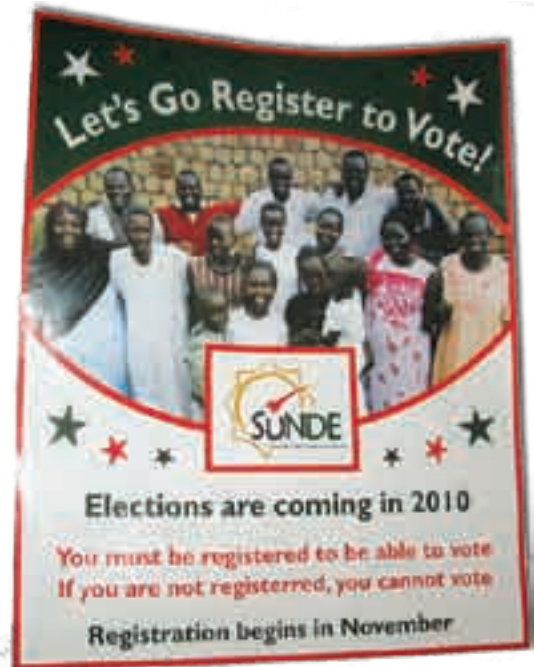
SuNDE advocacy urging populace to register for poll.

Gaining a head start for election monitoring, over 180 SuNDE observers acquired hands-on experience during the voter registration process. They visited 260