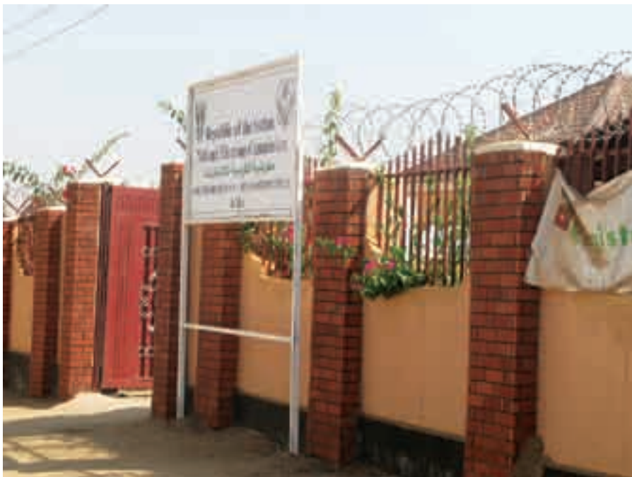
Southern Sudan High (elections) Committee office, Juba.

and technical support to the electoral process and provide contingency logistical assistance.