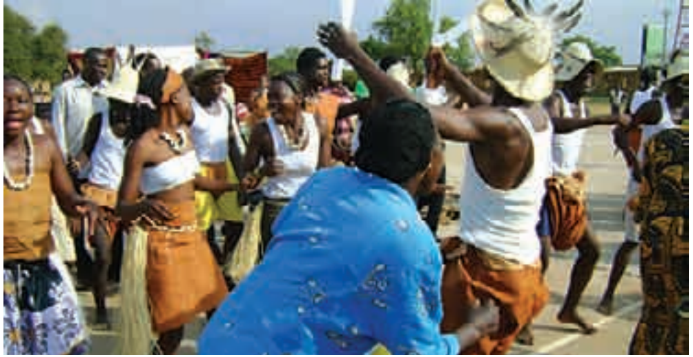
Azande cultural performance, University of Juba.

Gourds are used by the Azande and Acholi to produce sharp percussive sounds