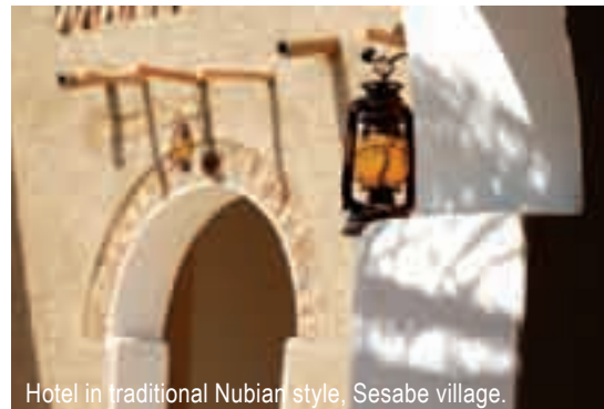
Hotel in traditional Nubian style, Sesabe village.