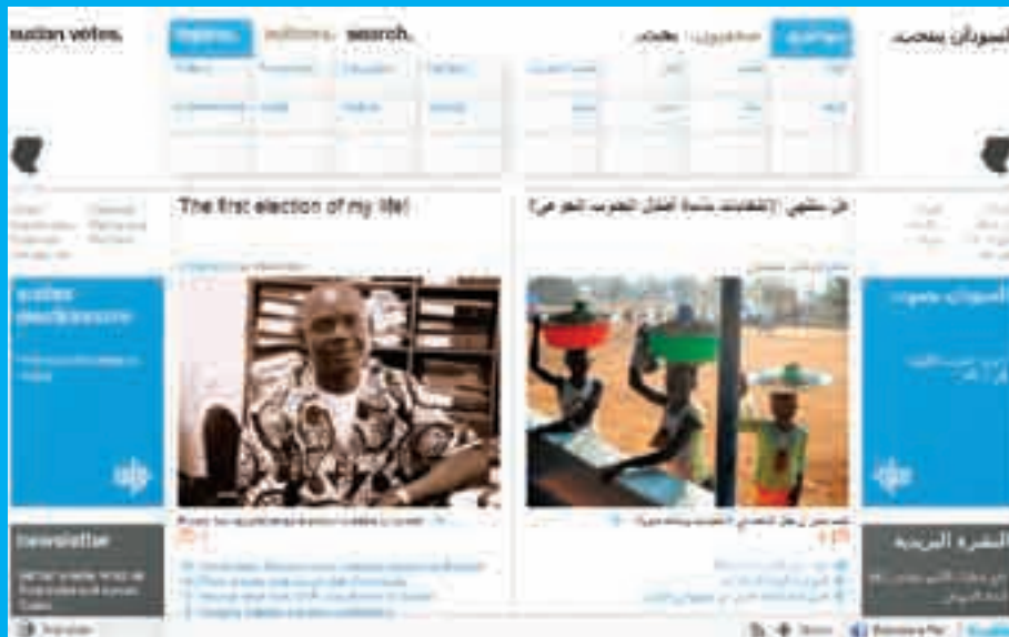
Screen shot of Sudanvotes.com website.