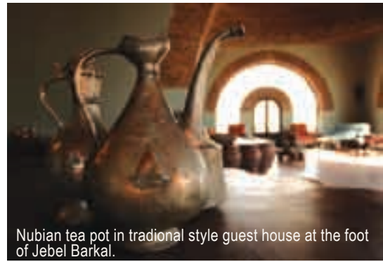
Nubian tea pot in traditional style guest house at the foot of Jebel Barkal.