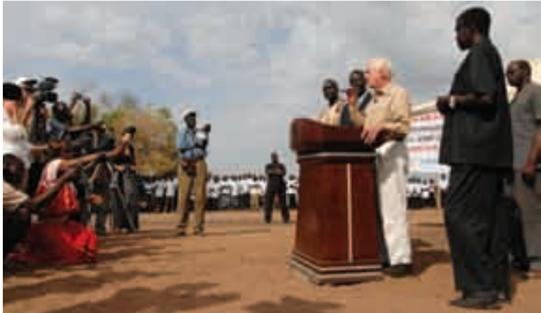
Former US President Jimmy Carter speaking in Molujore village, Terekeka County.