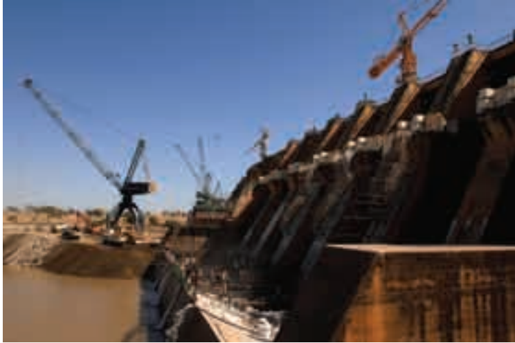
Construction workers heightening Roseres dam on Blue Nile near Ed Damazine.