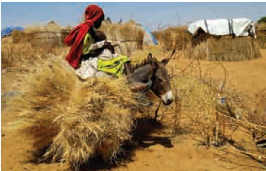
IDP woman coming back from fodder collecting, Tawila, north Darfur.

Although the number of registered voters -- an estimated 700,000 out of the about 850,000 eligible people in North Darfur State -- showed interest in elections, said State High Committee Spokesperson Ibrahim Musa, some internally displaced