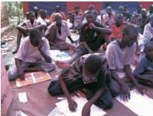
Juba prison drawing class for juveniles.