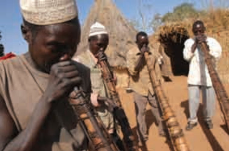
Traditional music and dancing in Qeissan, Blue Nile State.