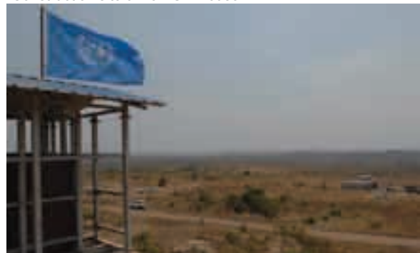
Security guard watching over construction of new UN House.