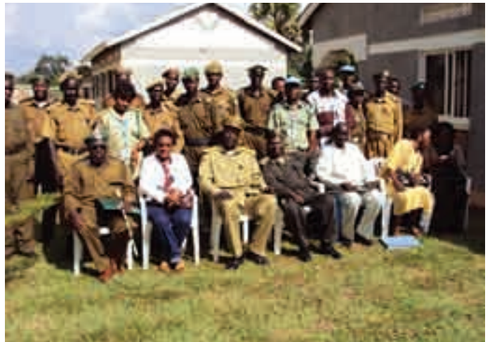
Participants at UNMIS training on juvenile justice, Yambio.