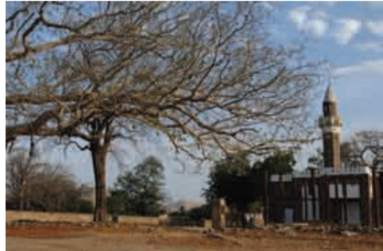
Above: Mosque in Baw. Below: Sunflower farms south of Ed Damazine.