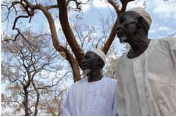
Descendants of Sultan of Funj in Fazughali at site of last Sultan's residence.