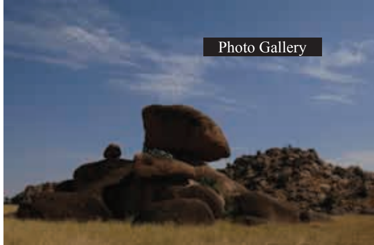
Rock formations south of Ed Damazin on road to Kurmuk.