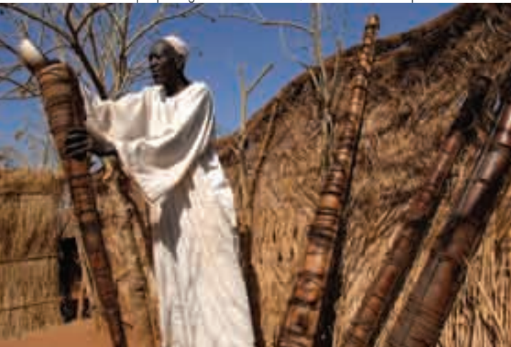
Traditional musician preparing instruments in Qeissan near Ethiopian border.