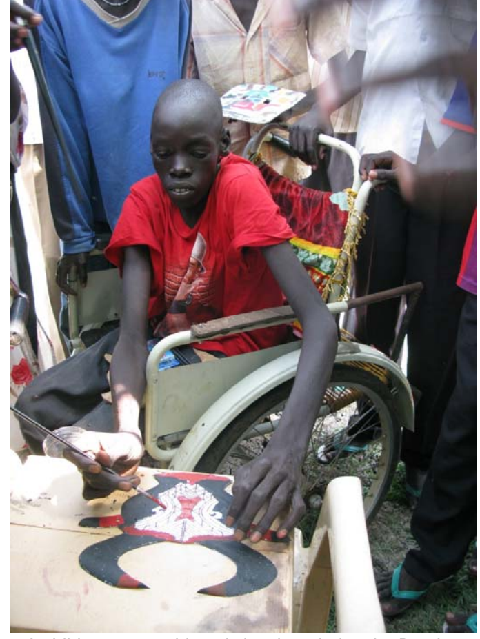
A child expresses his artistic talent during the Bentiu activities of the International Day of the African Child