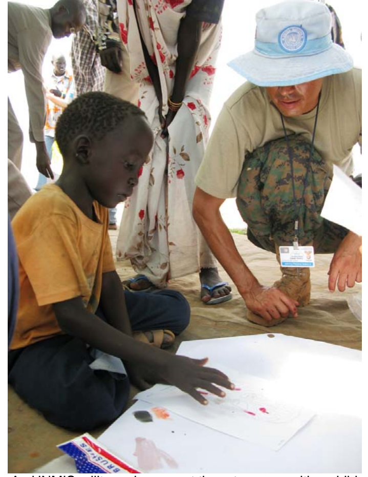
An UNMIS military observer at the arts corner with a child drawing