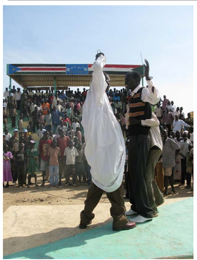
Drama group performing for children in the Bentiu stadium